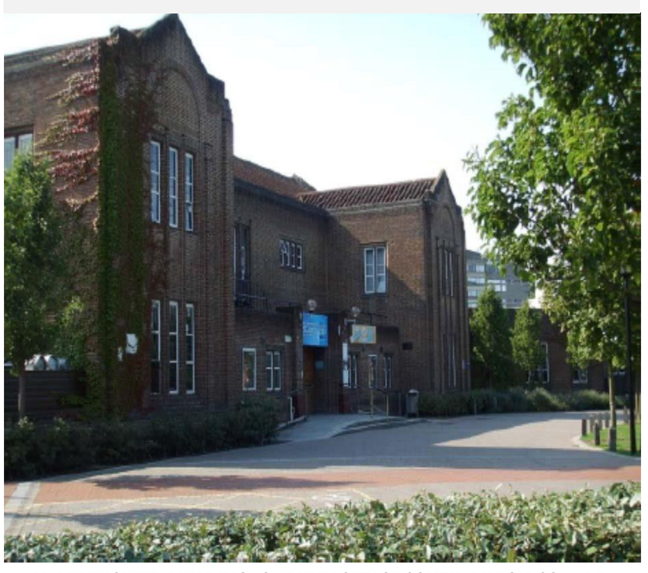
HARTLEY SUITE, BUILDING 38, UNIVERSITY OF SOUTHAMPTON, SO17 1BJ

Engaging multi-disciplinary perspectives